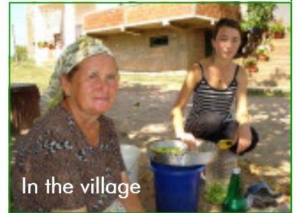
In the village