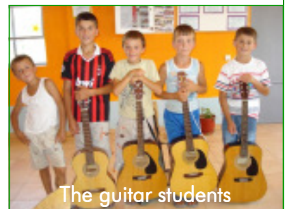
The guitar students