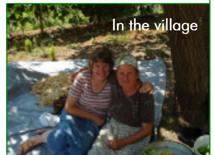
In the village